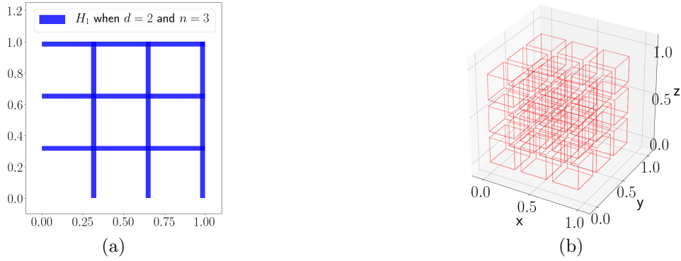
FIG. 3. An illustration of H_1 and n^d small non-overlapping sub-cubes that H_1 separates when n = 3 . (a) When d = 2 , H_1 in blue separates [0, 1]^2 into n^d = 9 sub-cubes. (b) When d = 3 , H_1 (no color) separates [0, 1]^3 into n^d = 27 sub-cubes in red.

353 Because \mu(H_1) \leq dn\delta , [0, 1]^d = \cup_{\theta \in \{0, 1, \dots, n-1\}^d} Q_\theta \cup H_1 , (3.6), and (3.7), we have